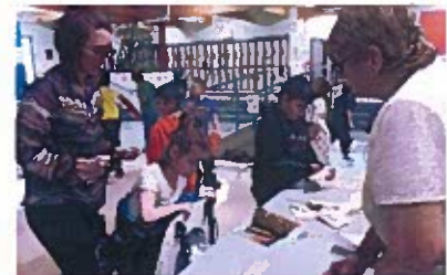
Metis Week Activities